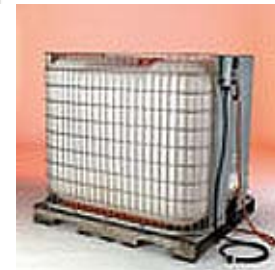
Step 3: Attach heater to controller to use.