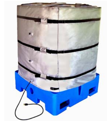
DM-600FWH Series Tote Heaters