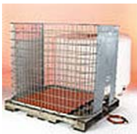
Step 1: Place HotPoly heater in IBC bin.