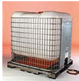
Step 2: Place poly tank on the heater.