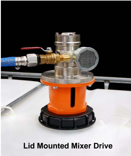
Lid Mounted Mixer Drive