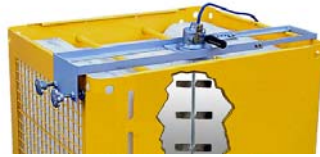
Top Rail Mount Tote Mixer