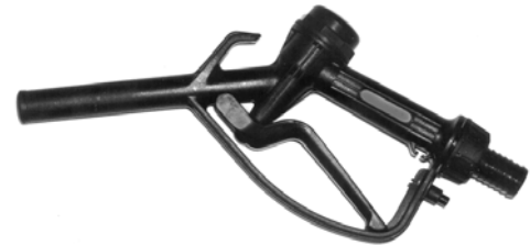
DM-85HFR Series Polypropylene Nozzle