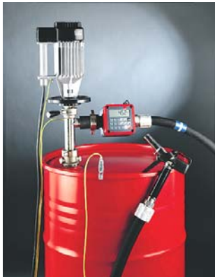
Drum Pump Metering

• Hand Pumps, Pneumatic, Electric, Double Diaphragm, Metering Pumps