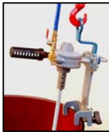
Open Drum Mixer