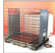
Bottom Pad, Tote