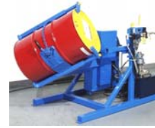
Self-Loading Drum Rotator