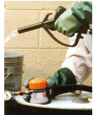
Air Op. Economy Pump