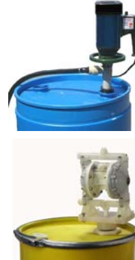
Electric & Air Op.