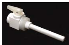
Teflon Hand Nozzle

• Hand Dispensing Nozzles, Spouts & Drum Drainers