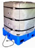
Full Wrap, Tote