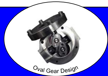
Oval Gear Design